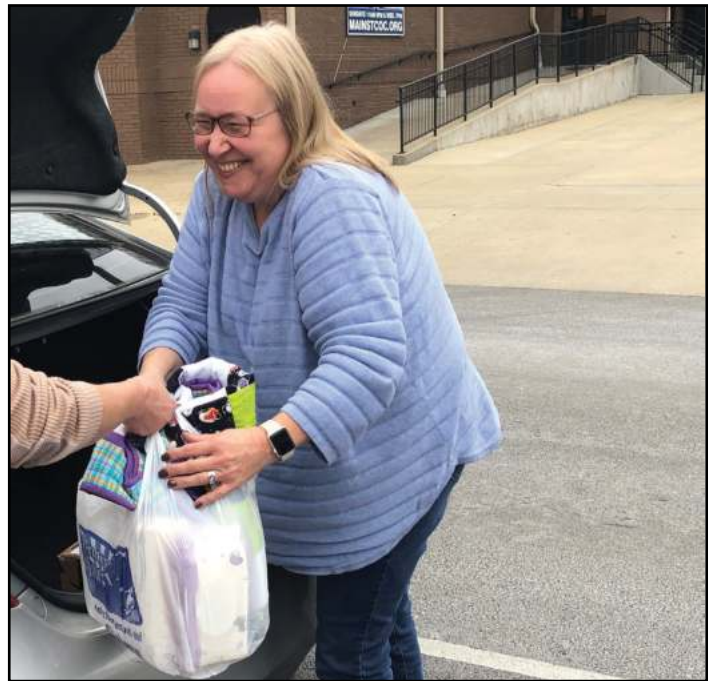
An Appalachian Pregnancy Care Center Grandparents Program client smiles as she receives donations from the center.