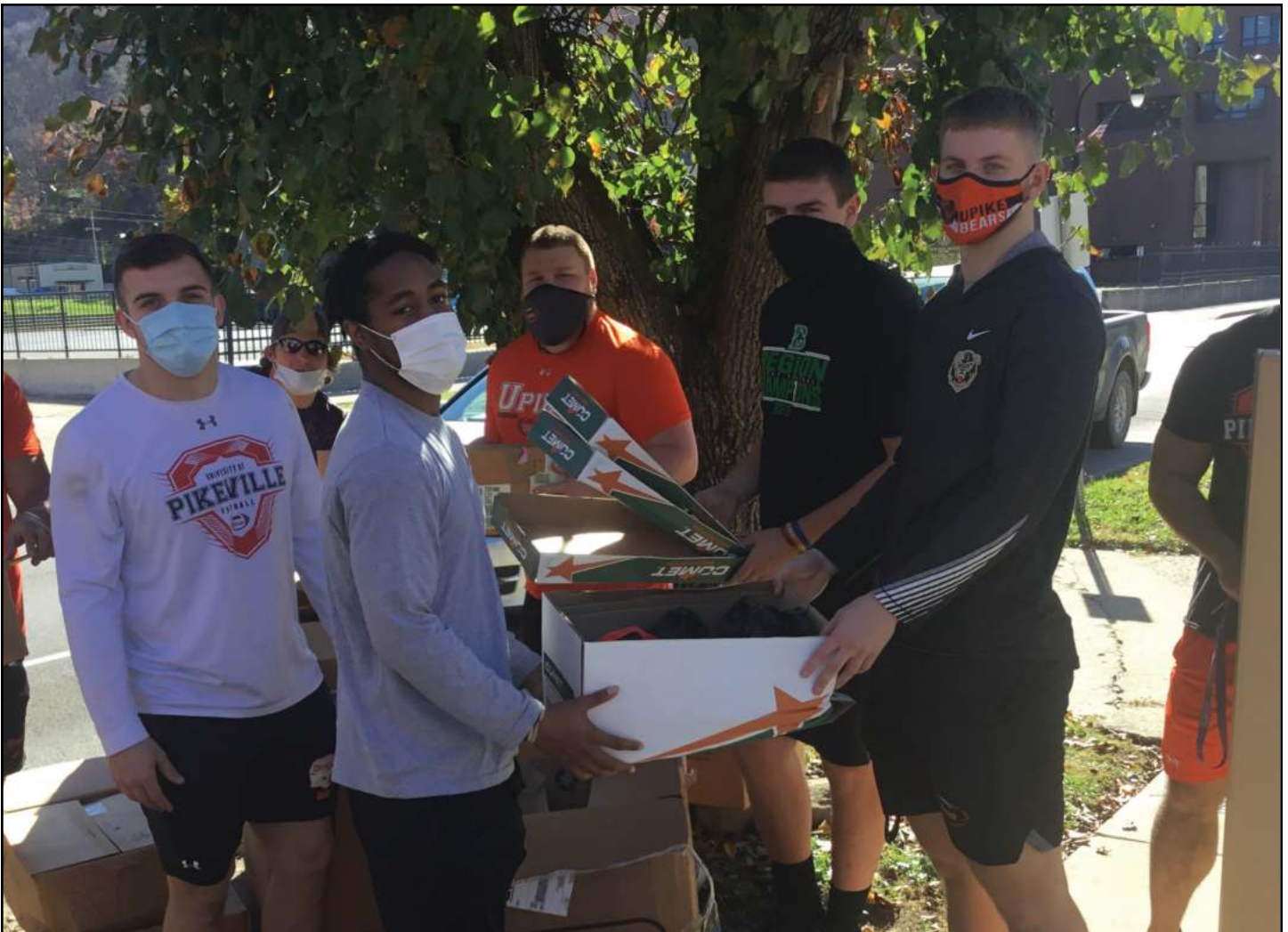
Football players from the University of Pikeville donate supplies to help the Appalachian Pregnancy Care Center.