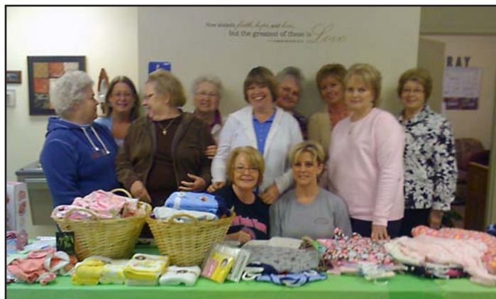
Garrett First Baptist Church WMU hosted a baby shower for the pregnancy center.