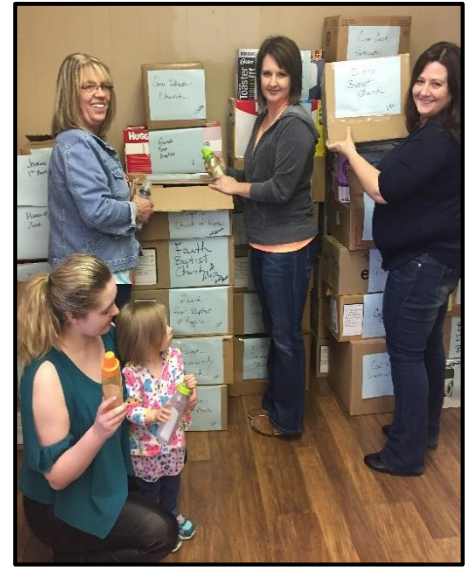
APCC volunteers prepare for baby bottle deliveries to local churches.

You can contact us at 606-433-0700. I want to personally thank you for the support you have always given!