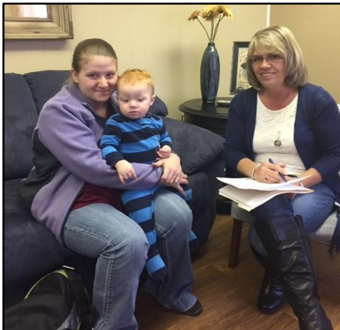
The “Earn While You Learn Program” at APCC offers parenting classes on numerous topics.