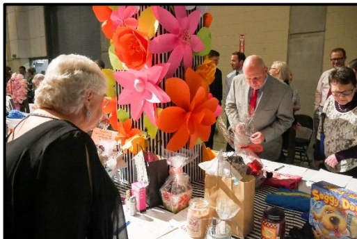
APCC supporters view silent auction items.