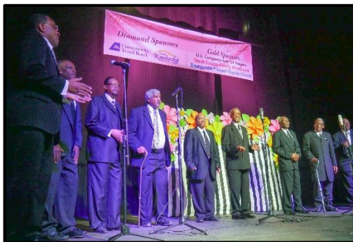
Greater Mt. Sinai Baptist Church Men’s Choir