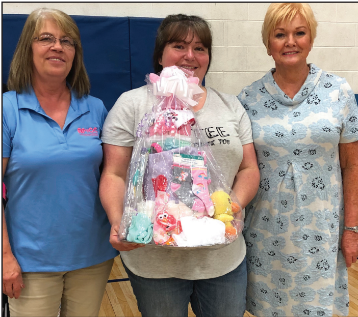
APCC clients earn items for their baby in the "Earn While You Learn" program.

The Appalachian Pregnancy Care Center provides a program called "Earn While You Learn." This program has